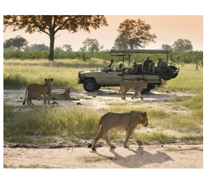
Day 7-10 Batonka Guest Lodge, Victoria Falls (Zimbabwe)