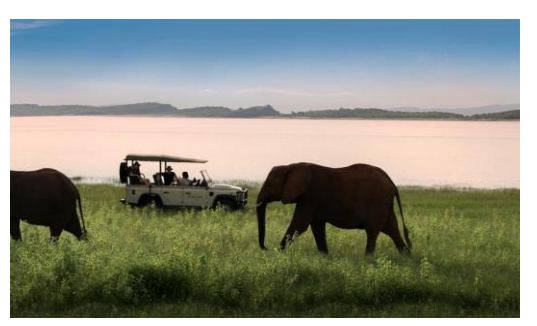
Day 4-7 African Bush Camps Somalisa Acacia Camp, Hwange National Park